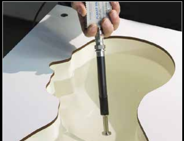
DAKS is low-cost, flexible, and very easy to use